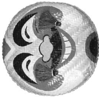
TET Mask, Vietnam

Instructions: Photocopy page onto card stock or paste page onto thin cardboard. Cut out cards along dotted lines. Shuffle cards and turn face down in front of you in even rows. Take turns turning over 2 cards. If cards do not match, turn them over and continue playing. Try to remember the masks in each row to match pairs. The person with the most pairs is the winner.