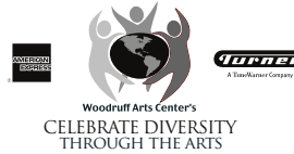
Exhibit supported in part by: