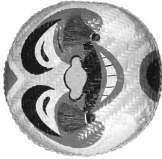
TET Mask, Vietnam