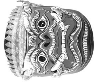
Lakon Khol, Cambodia