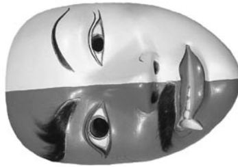
Two Souls, Java